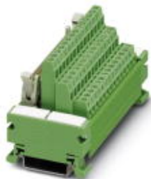
VARIOFACE module, with screw connection and flat-ribbon cable connector, for assembly on NS 35/7.5, 40 positions

Please be informed that the data shown in this PDF Document is generated from our Online Catalog. Please find the complete data in the user's documentation. Our General Terms of Use for Downloads are valid ( http://phoenixcontact.com/download )